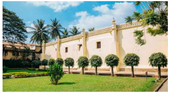
TIPU SULTAN'S SUMMER PALACE