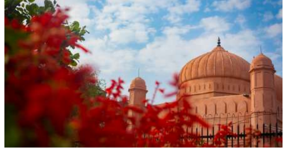
LALBAGH BOTANICAL GARDEN