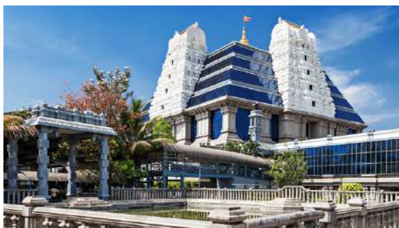
ISKCON TEMPLE BANGALORE