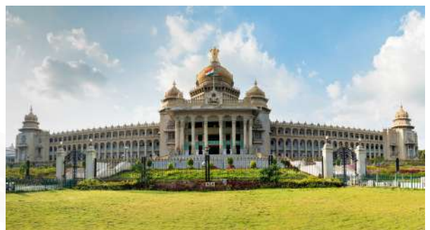
BANGALORE FORT AND BANGALORE FORTIFICATION